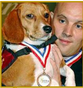
Belle, a beagle, literally bit "911" into her owners cell phone, saving his life.